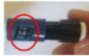
G (14 units selected) (選擇14個單位)

Make sure to clean your skin area prior to injection. Do not rub. 注射前請確保皮膚清潔。不要擦。