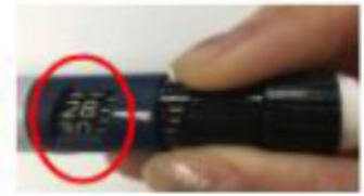
H (28 units selected) (選擇28個單位)